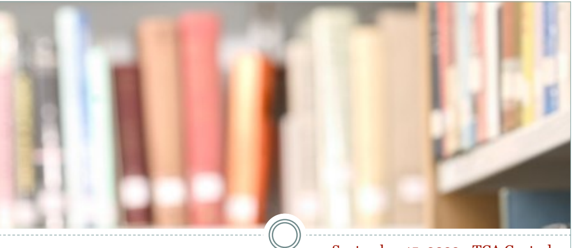
September 15, 2023– TCA Central

Finding value in building relationships full of positivity, empathy, gratitude and humor.